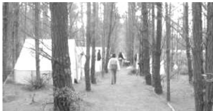
The company street at the recent National Skirmish.