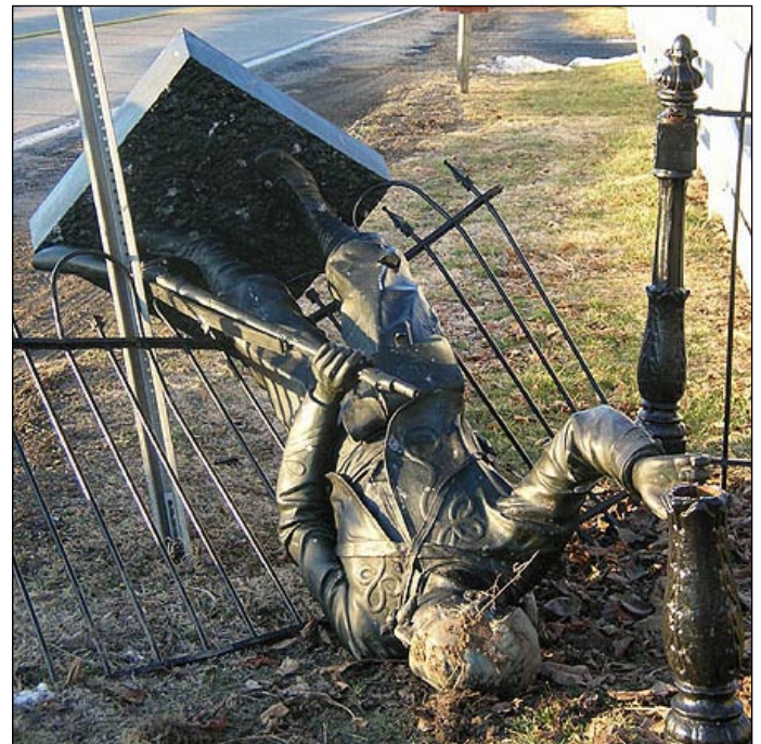
A sad looking 114th Pennsylvania Volunteer Infantry monument at Gettysburg.

The 6,000-acre park houses some 1,300 monuments to the tide-changing July 1863 battle between the Union and Confederate armies.